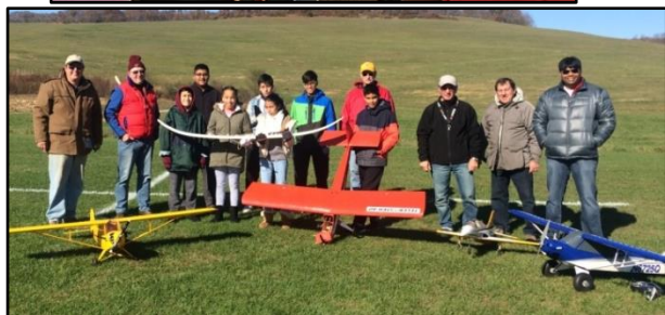
Fly RC (radio controlled) model airplane club