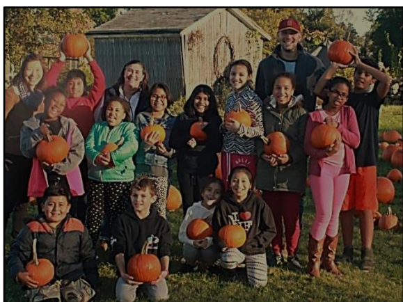
The Hickories Farm in Ridgefield